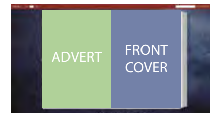
option 3 + inner cover